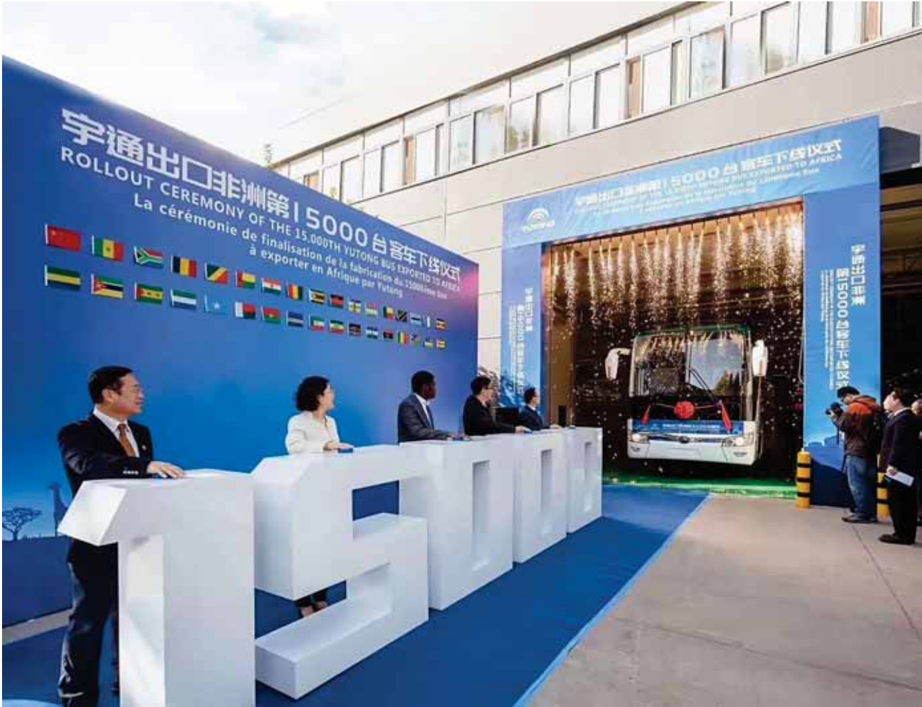
The 15000th bus for Africa rolls out of the factory

firm, one of our top priorities as we expand overseas has been localizing our strategies to help drive local employment.”