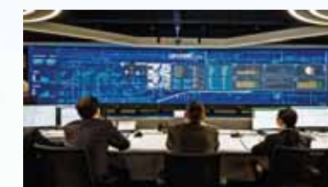
Intelligent command center