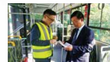
Testing and evaluation of drivers' skills