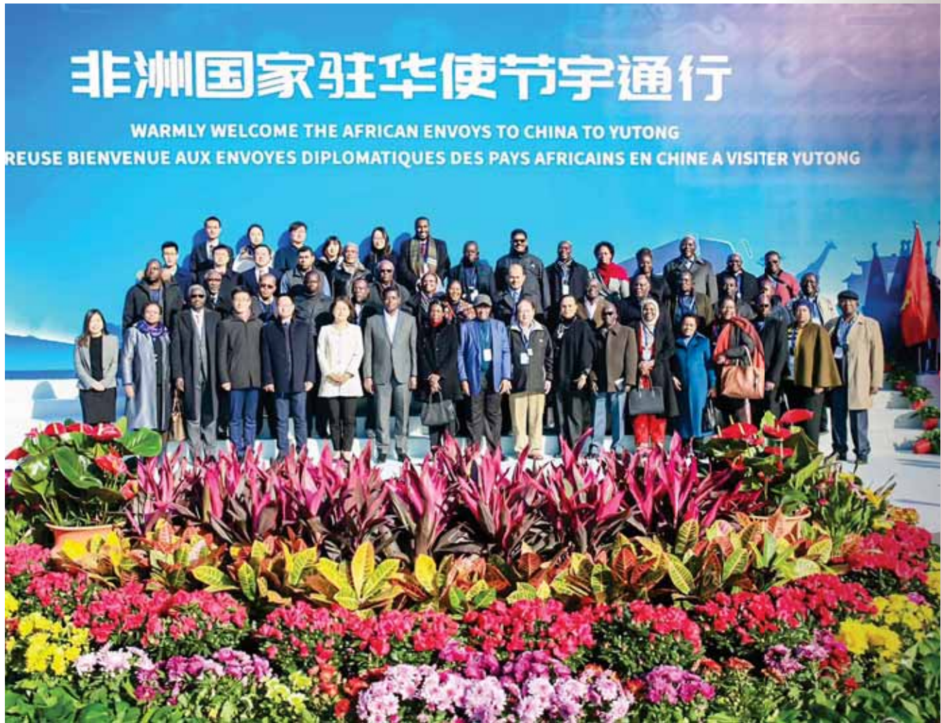
Representatives from African countries visit Yutong factory in Henan