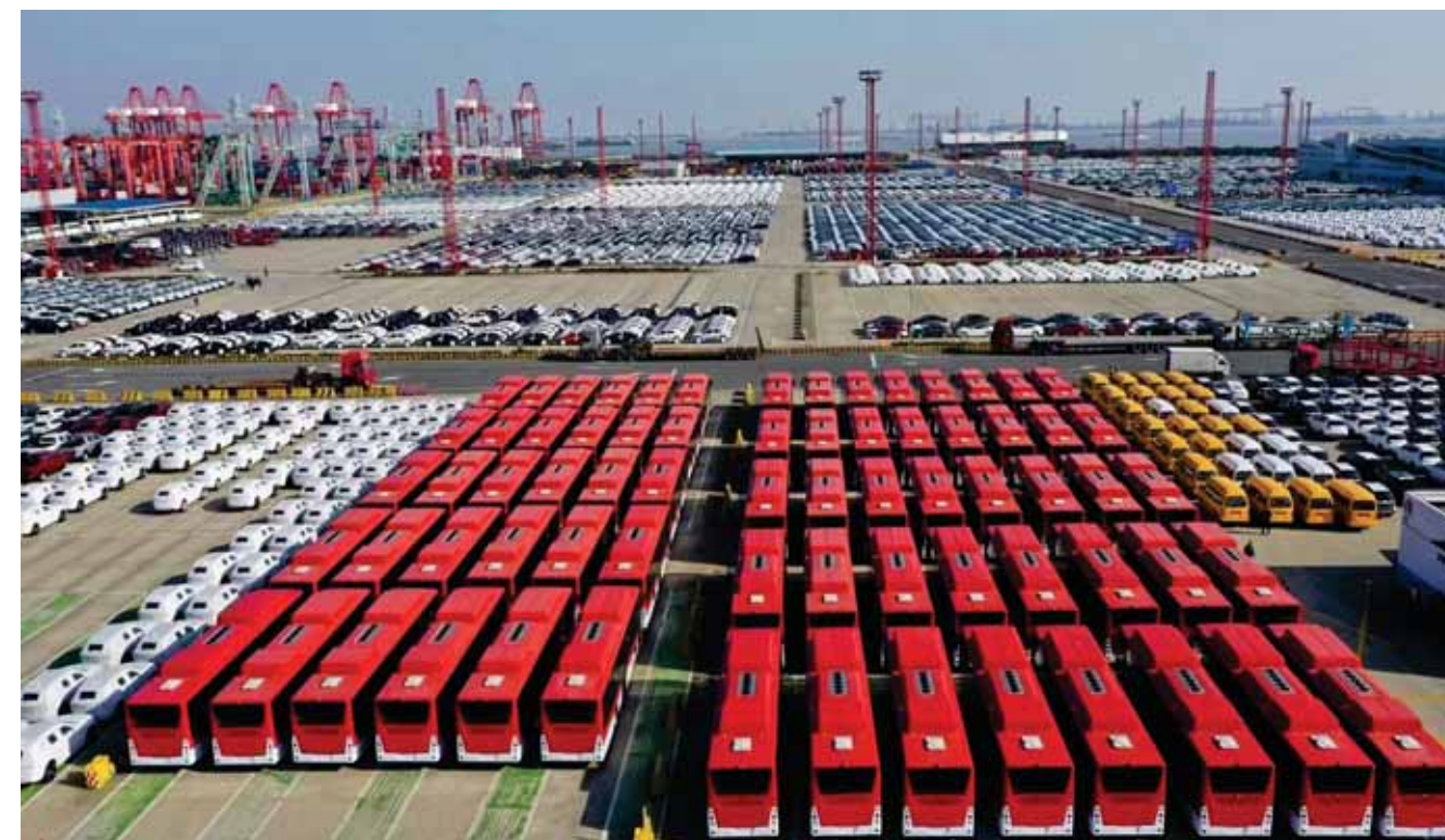
Yutong E12 full electric buses

launched an environmental-friendly urban development policy, part of which includes a program to replace current city buses with new-energy vehicles by 2050.