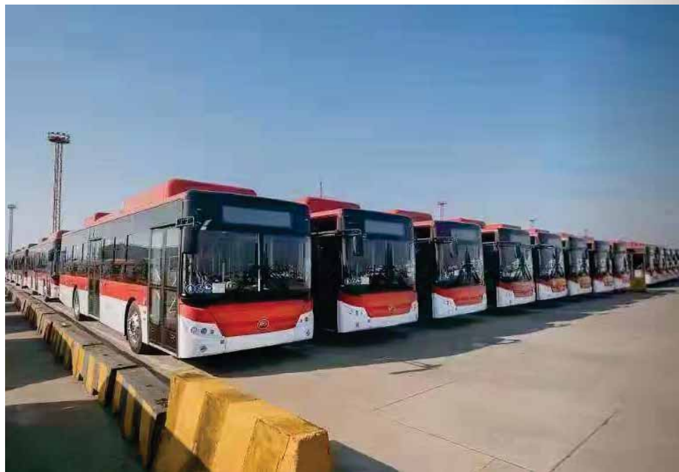
100 Yutong full electric buses delivered to Chile

The 100 full electric buses will be used by Buses Vule and STP Santiago to serve the Santiago public transportation system, Yutong’s delivery comes as the Chilean government