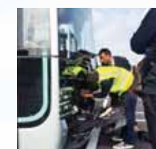
Proactive maintenance of vehicles